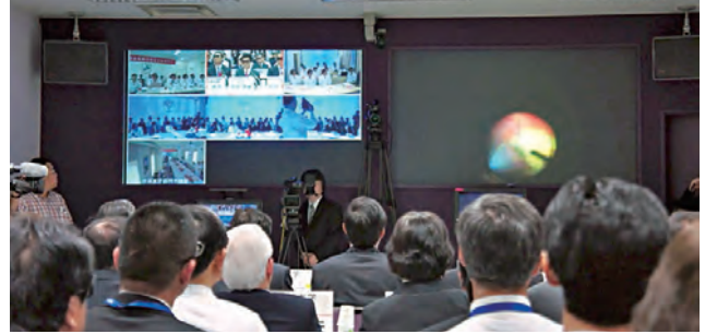
International Conference through the Telemedicine Network

In order to reduce and eventually resolve problems in underpopulated areas and urban-rural medical service discrepancies, we connect with hospitals in rural areas through the telemedicine network and we have established medical systems to provide patients everywhere with advanced medical treatment.